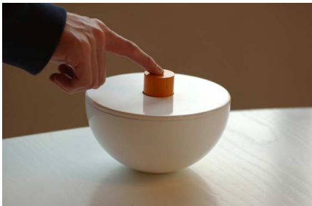
Figure 3: one.

“one” is a sphere split in half. Two rods stick out from the center of “one”, which can be pushed in and out to communicate a sense of touch. Two distant people each have a “one”. When the center rod is pushed in at one end, the rod on the other end moves up. If the rod is pulled out, the other moves down.