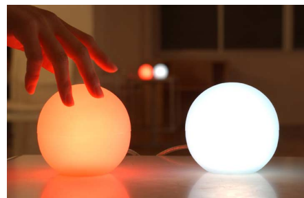
Figure 1: air.

“air” communicates a feeling of presence to a distant partner through light. “air” consists of two pairs of blue and red lamps connected over a network. One person controls the blue lamp and the other, the red lamp. When a colored lamp is turned on at one end, the same color lamp on the other end is also turned on. In the same way, the lamp can be turned off.