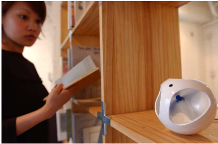
Figure 2: anemo.

“anemo” detects sounds within a room and triggers its counterpart’s propeller to spin. “anemo” spins in sync with conversation or music in the other room. As the sounds grow louder, “anemo” spins faster.