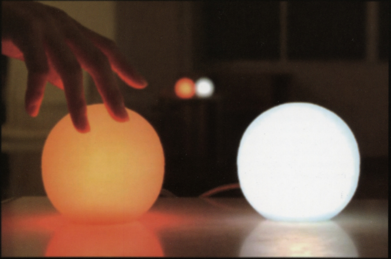
'Small Connection' (2004) Hideaki Ogawa

An international exhibition of interactive media art works combining multiple media, new technologies and conceptual approaches into novel artistic ideas that provide new perspectives on the notions of absence and presence.